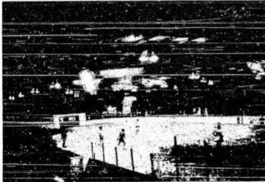
INDOOR SOCCER. It's not quite the same as outdoor soccer, but the idea is still the same at the Indoor Soccer and Fitness Center.