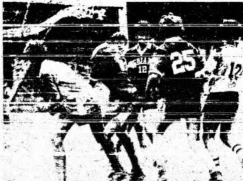
A GOOD KICK IN THE PANTS is what this unidentified Quaker Valley High School soccer player delivered to a North Hills opponent during QV's 4-3 loss last Thursday.