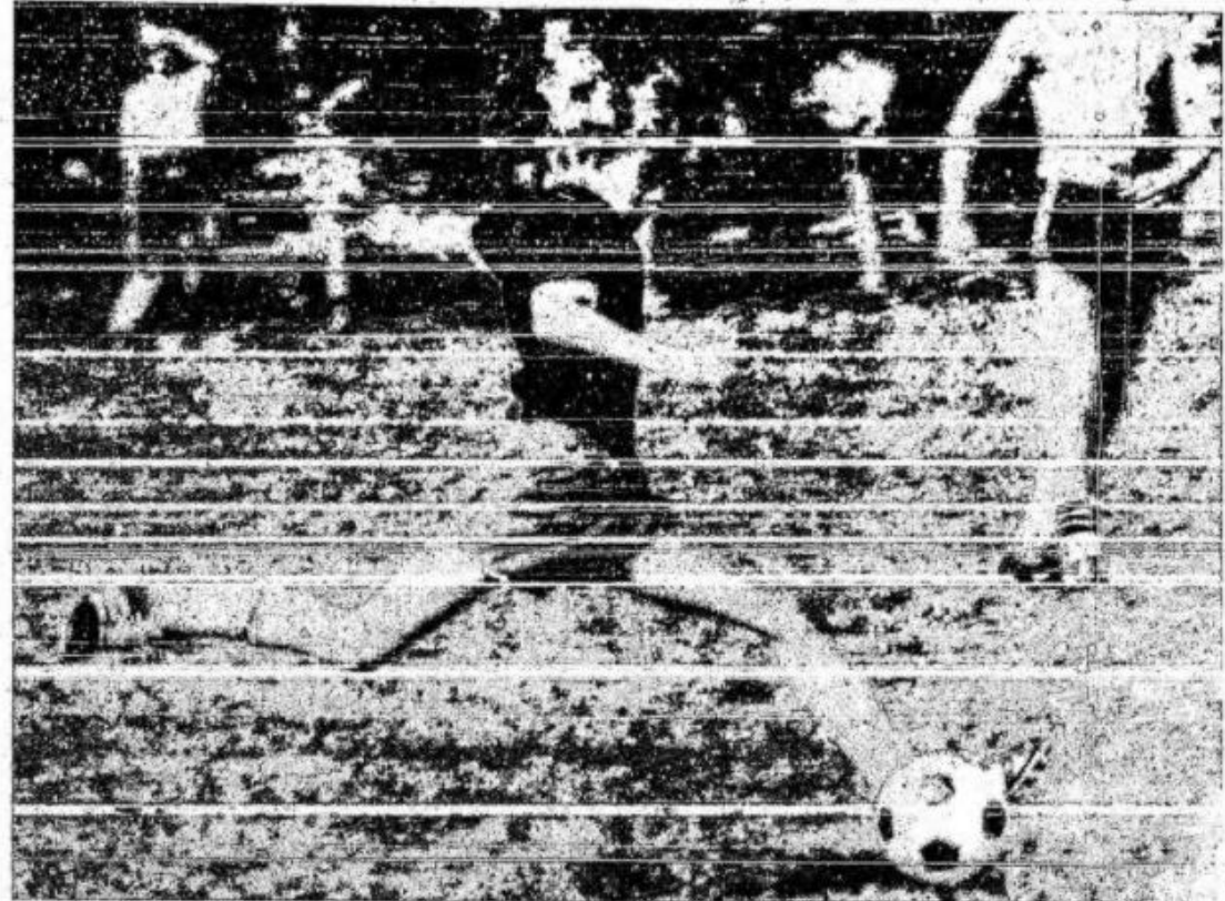
FRANK COURTNEY shows some of the speed that helped Sewickley Area Soccer's Under 12 all-star

total of seven games, they scored 24 goals and had only 6 goals scored against them.